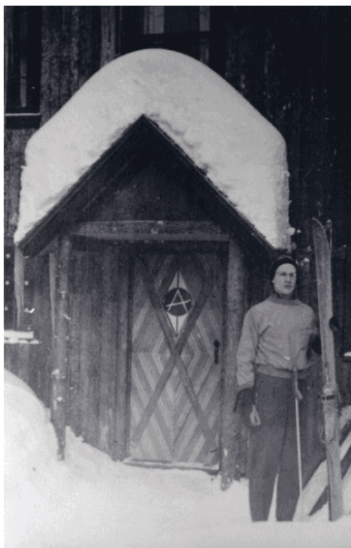
Skier at the Arlberg Clubhouse in 1938